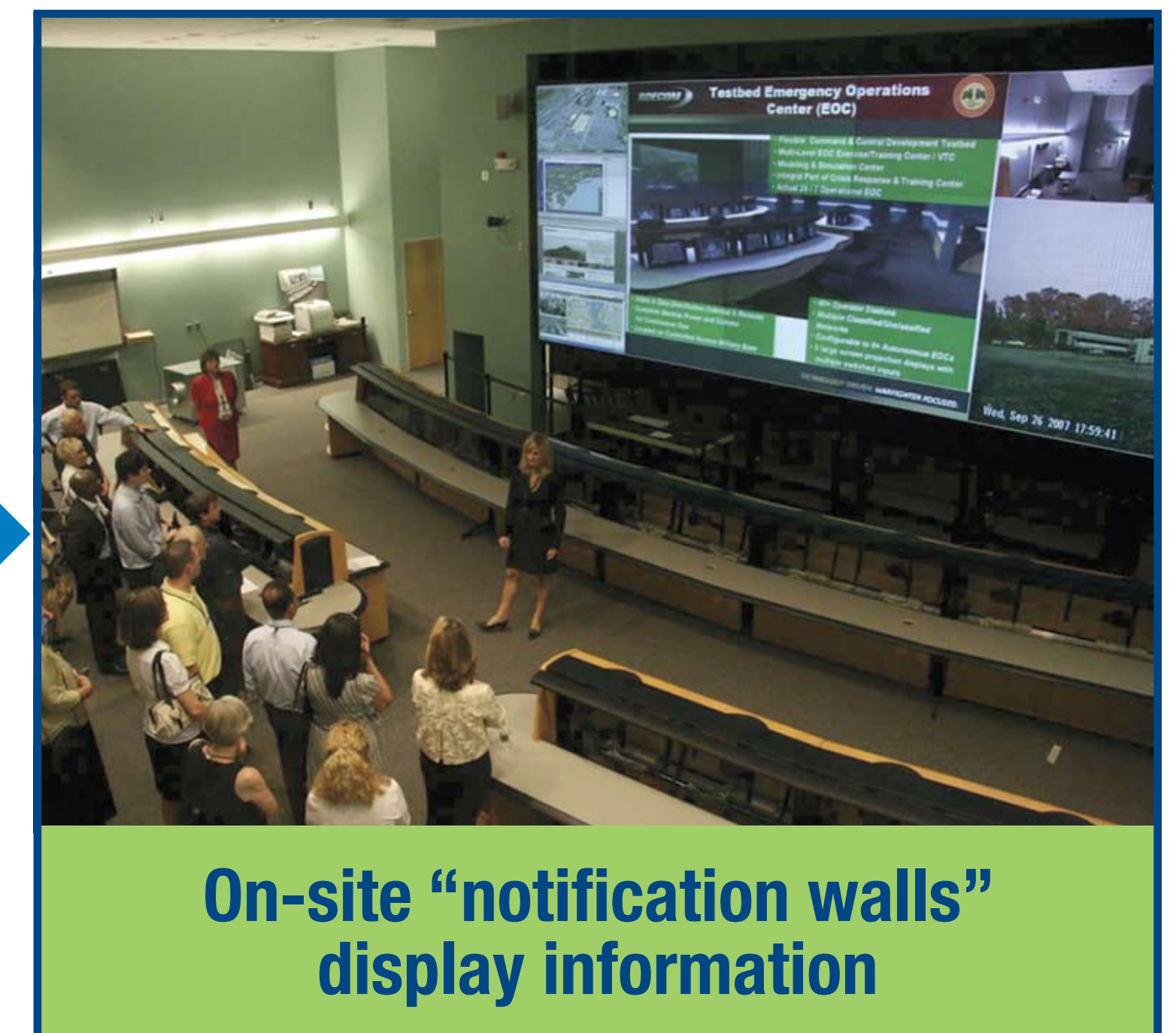
On-site "notification walls" display information

A prototype system to search for and display description and pictures of lost persons to address surge in a disaster