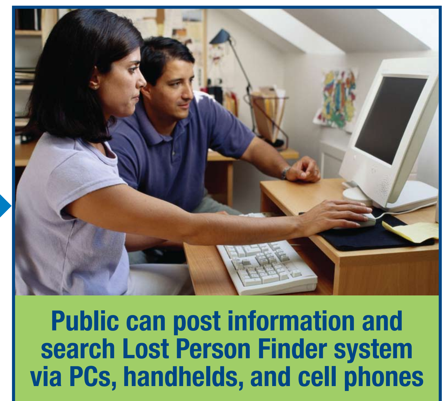
Public can post information and search Lost Person Finder system via PCs, handhelds, and cell phones